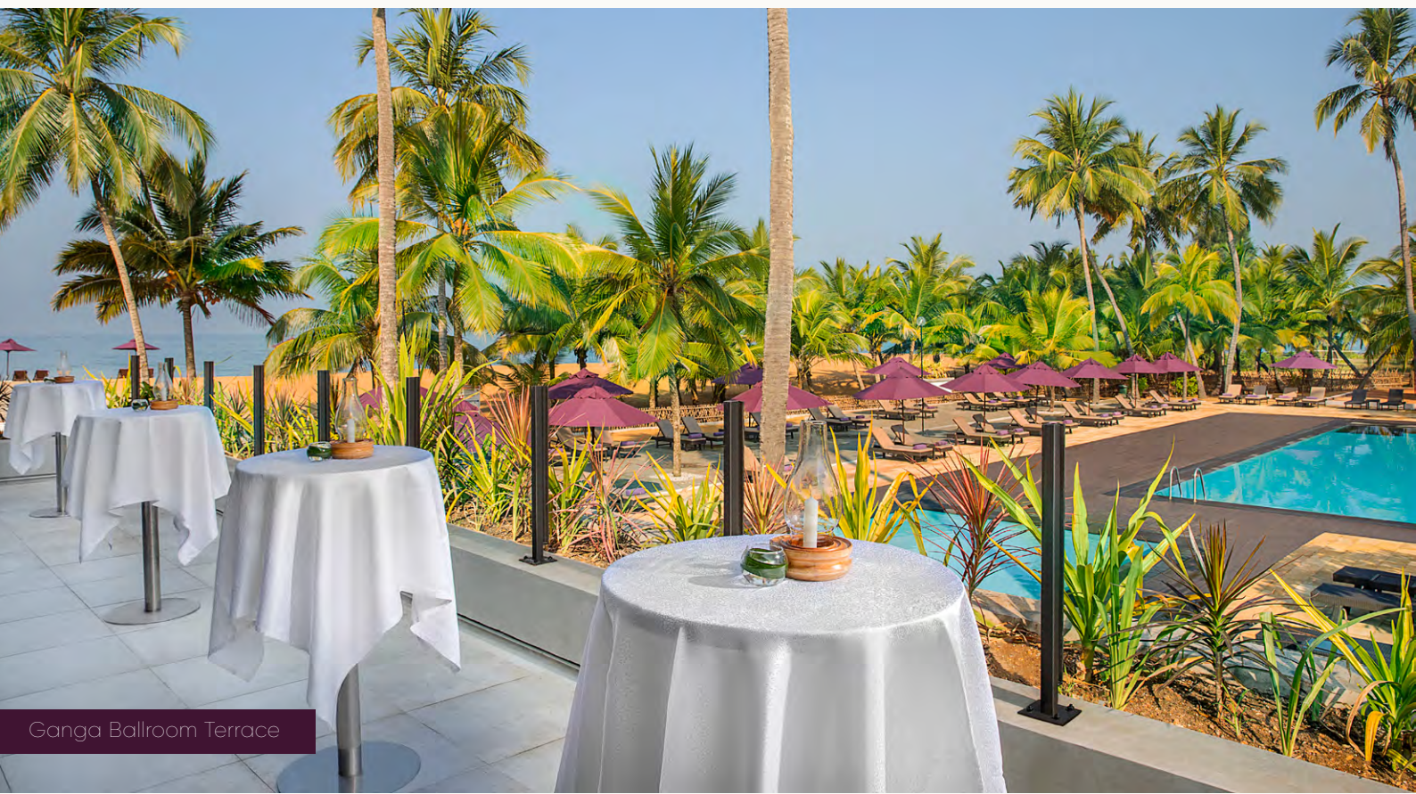
Ganga Ballroom Terrace