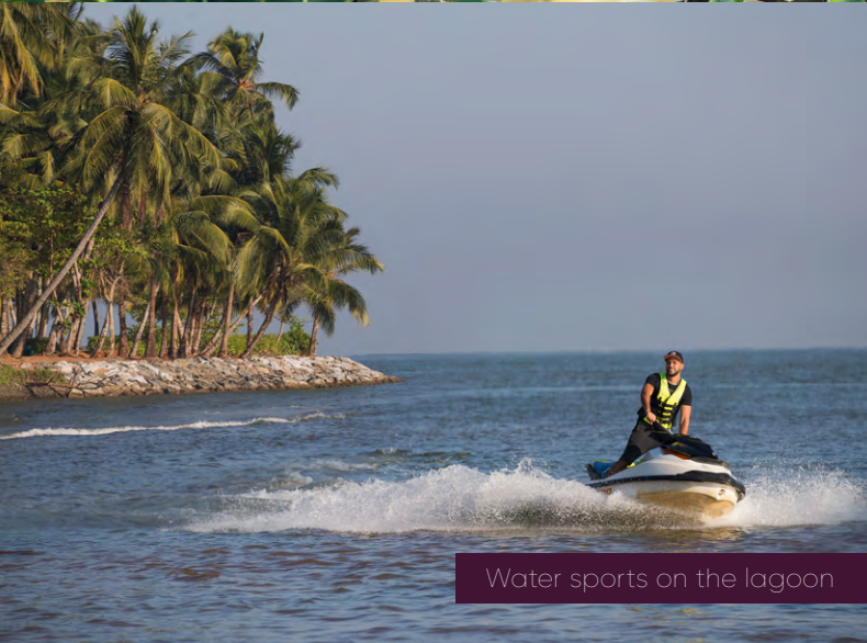
Water sports on the lagoon