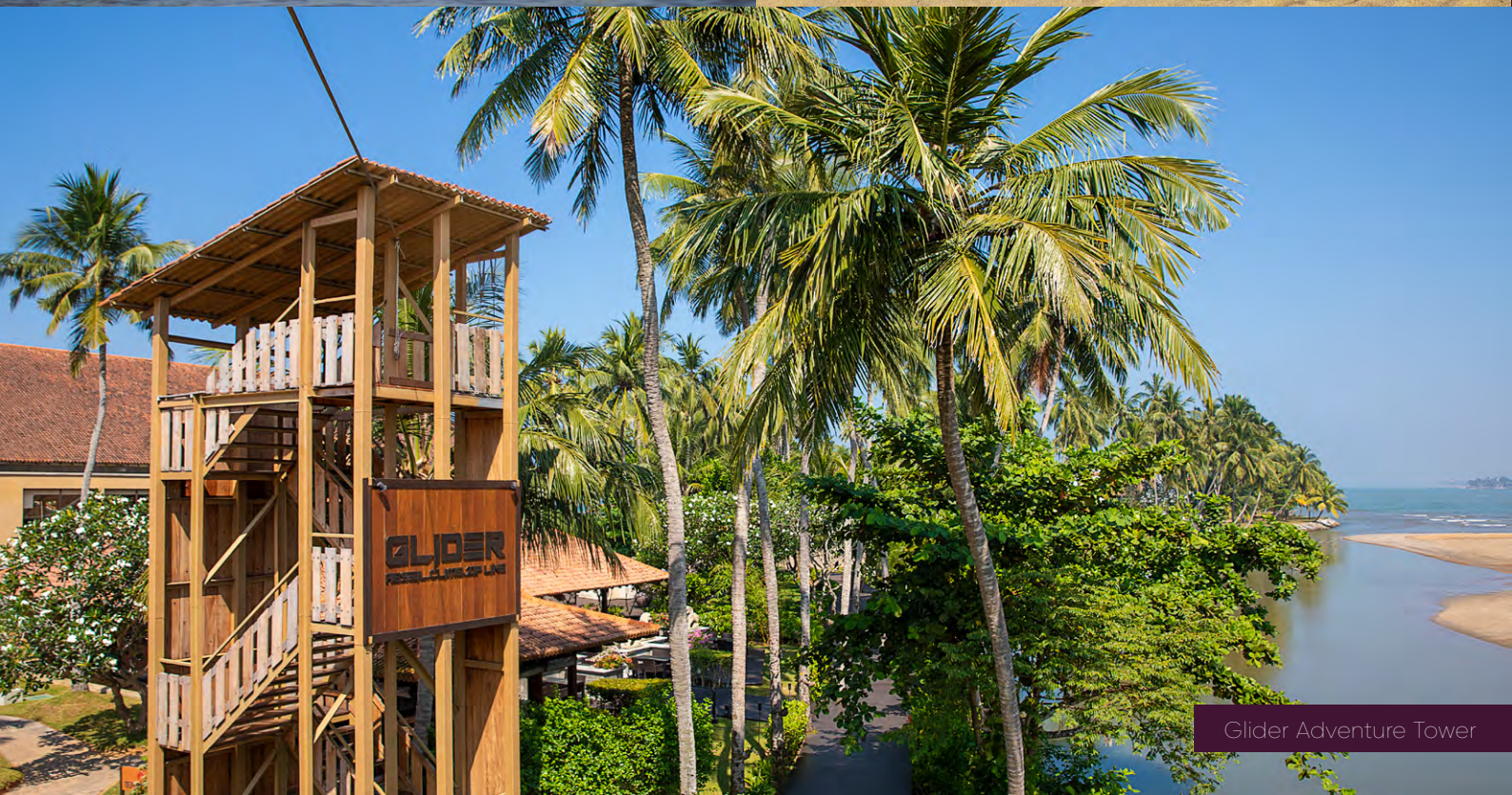
Glider Adventure Tower